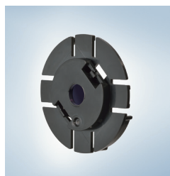
BL Filter MAJ-2544