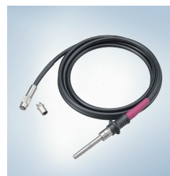
Light Guide Cable A93200A