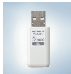
OTV-S700 Upgrade Pack BL MAJ-2513