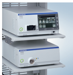
VISERA ELITE III Video System Center OTV-700 LED Light Source CLL-S700