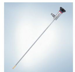
OES ELITE Telescope